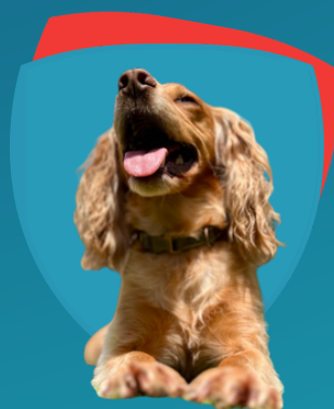
Teal Wellbeing Dog