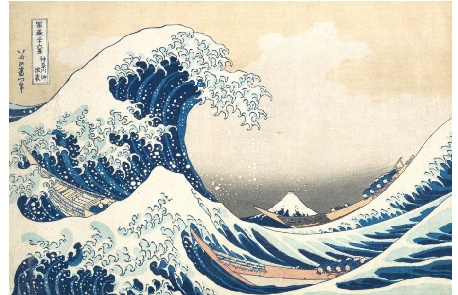
Under the Wave off Kanagawa by Katsushika Hokusai