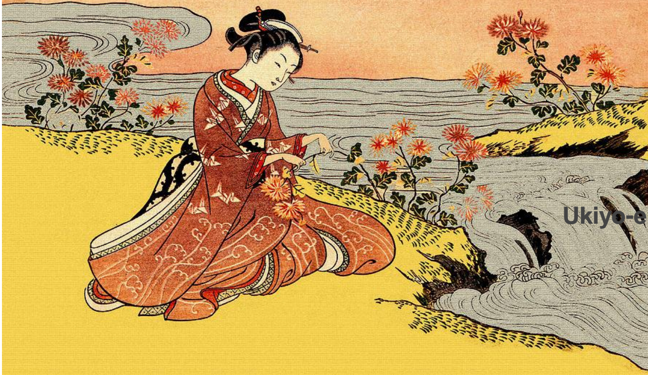
Girl by River - Vintage Japan Ukiyo-e Woodcut is a drawing by Just Eclectic

The artist you will study this term is inspired by Ukiyo-e . Ukiyo-e translates literally "pictures of the floating world". It is a genre of Japanese woodblock prints or woodcuts and paintings produced between the 17th and the 20th centuries, featuring motifs of landscapes, tales from history and the theatre.