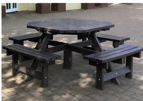
100% Recycled Plastic Picnic Bench

As you will be aware, we are currently encouraging pupils to spend their break and lunchtimes enjoying the fresh air outside. To make this experience even better, we will be using some of the Future Fund money to purchase additional outdoor seating, mainly in the form of picnic benches, as pictured below.