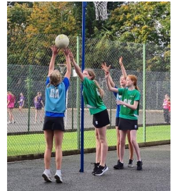
Year 9 players